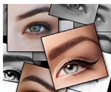
Forget tattooing your brows and try this...