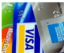
Never transferred your credit card balance? Big