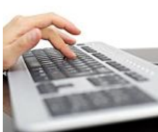
16 Business Lessons Generation Y Should